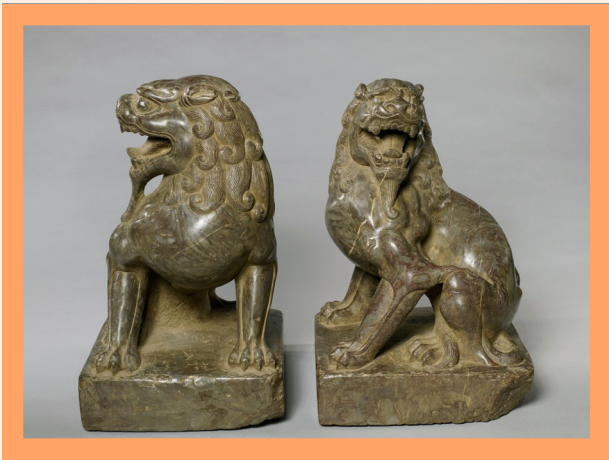
“Guardian Lion, one of a Pair” in Gallery 208