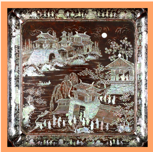
“Tray” Gallery 210