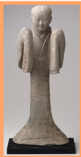
Female “Long Sleeve” Dancer