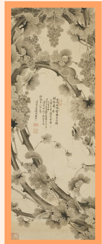
“Squirrel and Grapevine” Gallery 203,